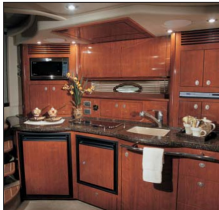
Fully equipped galley boasts handcrafted cabinets, solid surface countertop, touch pad two-burner stove, plus under-counter refrigerator and freezer.