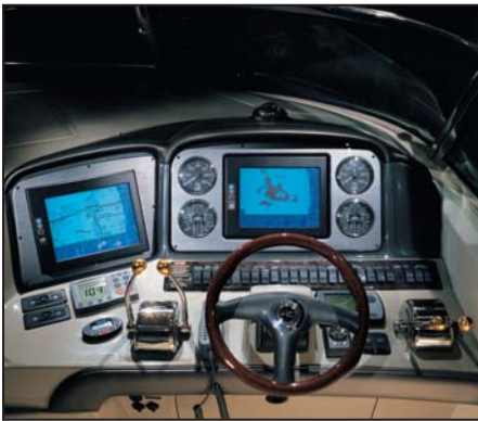
Nickel-tone gel-coated dash features a full complement of SmartCraft™ diagnostic instruments, illuminated weatherproof switches, and a wood-accented steering wheel.

With its sweeping deck lines and dramatic profile, this elegant new 390 Sundancer is sure to get noticed. This newest addition to the Sundancer family features a sleek, wood-trimmed helm with custom-designed instruments, plus an optional fiberglass hardtop. Engineered to outpace every other boat in its class, the 390 Sundancer offers a spectacular combination of style, power and grace.