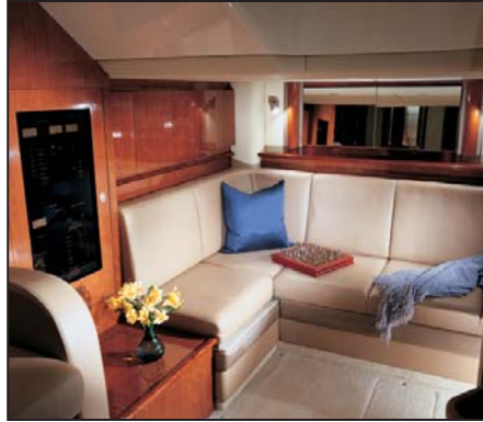
Conversation area converts to comfortable stateroom with slide-out bed, privacy curtain, and lots of storage.