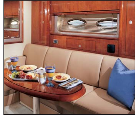
Glove-soft Ultraleather HP™ sofa makes this versatile salon both elegant and comfortable. Extras include wood blinds and high-gloss wood table.

Sea Ray Boats, 2600 Sea Ray Blvd., Knoxville, TN 37914. For information call 1-800-SRBOATS or fax 1-636-326-3282. Internet address: http://www.searay.com Note: Not all accessories shown in pictures or described herein are standard equipment or even available as options. Options and features are subject to change without notice. Not all model year boats may contain all the features or meet the specifications described herein. Confirm availability of all accessories and equipment with an authorized Sea Ray dealer prior to purchase. Printed in the U.S.A. July 2004 ©Sea Ray Boats.