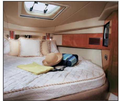
Forward stateroom includes full-size bed with innerspring mattress, mirrored locker, 13" TV/DVD player, and sliding pocket door.