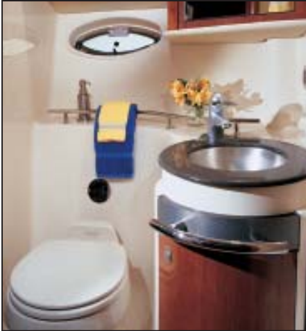
Accessible from both the forward stateroom and salon, this roomy head compartment features designer vanity, stainless steel handrail, and large, VacuFlush® toilet.