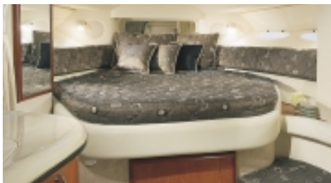
The forward V-berth features an island bed with storage beneath, hanging lockers, a privacy curtain, and port lights for natural light.